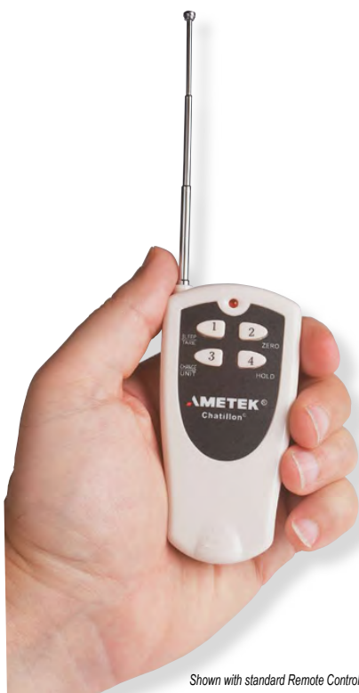
Shown with standard Remote Controller. Perform scale functions up to 100m (300 ft) away.