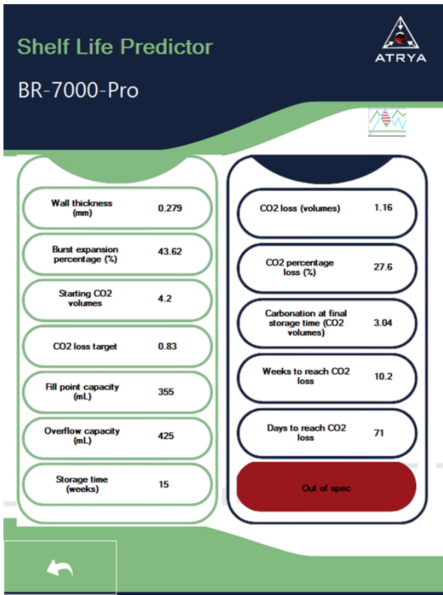
Sample Test Results Screen