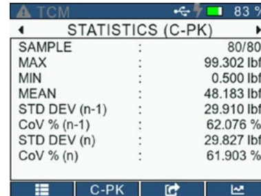
Statistics on saved results can be exported...