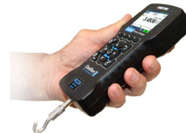
The comfortable ergonomic design makes the DFE3 a pleasure to use.

The Time method allows you to establish your load averaging based on a load threshold and time duration. The load threshold determines the start of the averaging, while the time duration defines the length of the test period. The gauge will begin taking readings when the threshold is reached and will continue to take and average readings until the time duration has expired.