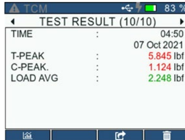
Saved results on the internal 32 GB SD card can be viewed and exported.