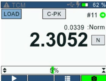
Live result screen with run number, pass/fail indicator, units, and display mode.