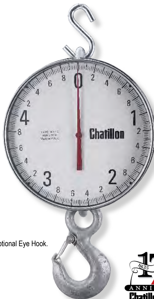
Shown with optional Eye Hook.